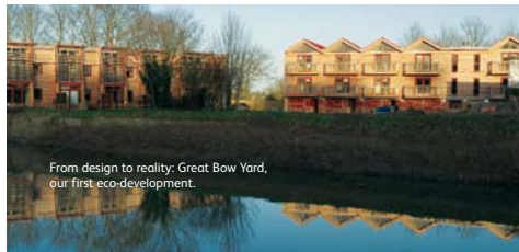
From design to reality: Great Bow Yard, our first eco-development.